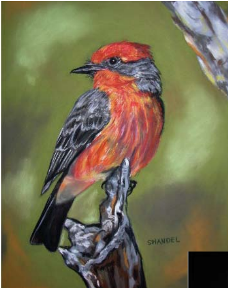
A Flash of Red